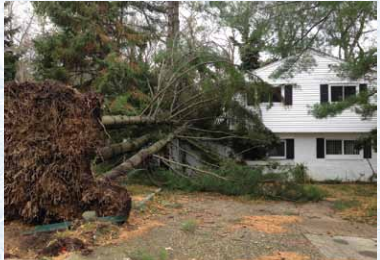
Uprooted trees lie across a home in Glen Cove, Long Island.