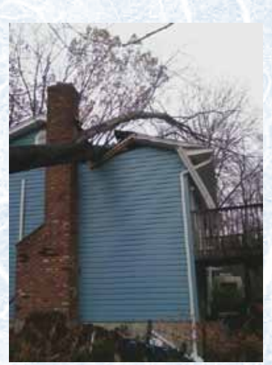
A fallen tree lies on a home in New Windsor, N.Y.