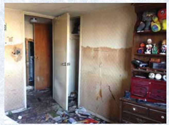
Water damage from Sandy.

Fries' agency couldn't access the building, but staff showed up for work anyway. "We staffed people here at the building. They couldn't be in the building but we had people sitting in their cars in the parking lot waiting. We knew people might show up saying 'How to file a claim? Where's my policy? What can I do?""