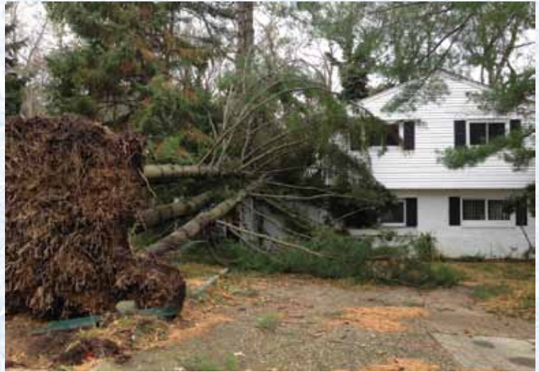
Uprooted trees lie across a home in Glen Cove, Long Island.