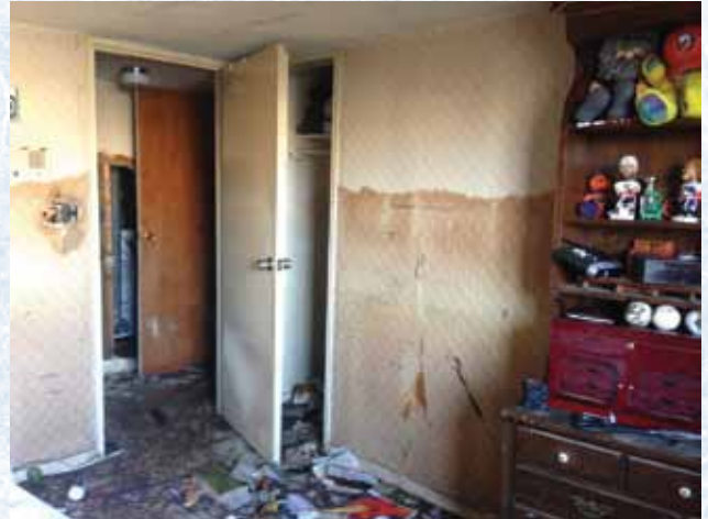
Water damage from Sandy.

Fries' agency couldn't access the building, but staff showed up for work anyway. "We staffed people here at the building. They couldn't be in the building but we had people sitting in their cars in the parking lot waiting. We knew people might show up saying 'How to file a claim? Where's my policy? What can I do?'"