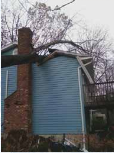
A fallen tree lies on a home in New Windsor, N.Y.